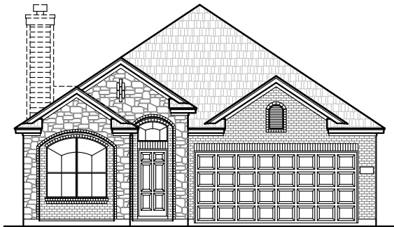
Optional Elevation C1