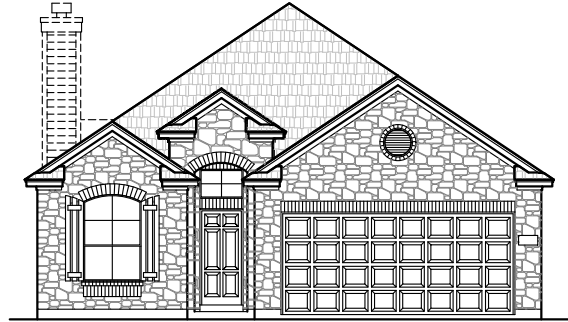
Optional Elevation A2