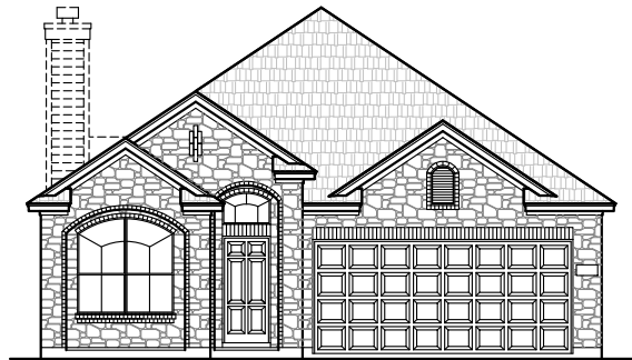
Optional Elevation C2