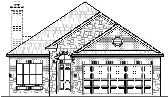
Optional Elevation B1