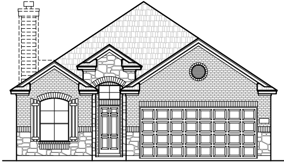
Optional Elevation A1